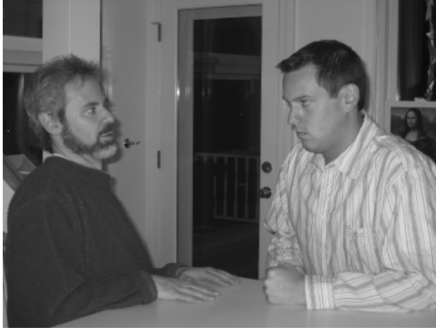
Fig. 1. The priming stimulus. Participants in the fear- and anger-priming conditions viewed this stimulus and told a story about either the fearful (in the fear-priming condition) or the angry (in the anger-priming condition) character. Participants in the neutral-priming condition saw a cropped, less emotional version of this stimulus and told a story about a neutral conversation the two characters were having.

unpleasant affect, pleasant affect, high-arousal affect, and low-arousal affect (the raters discussed any discrepancies between judgments until 100% reliability was achieved). This coding procedure allowed us to assess the full range of emotional (fear, anger) and affective (unpleasant, pleasant, high arousal, and low arousal) content produced by participants during the priming manipulation and allowed us to verify that our priming procedure was, in fact, effective.